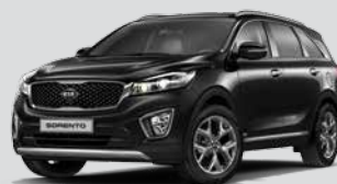
Aurora Black Pearl