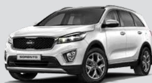
Snow White Pearl