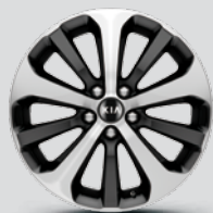
18" Alloy wheel