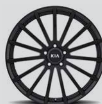
20" Alloy wheel