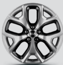
19" Alloy wheel