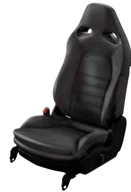
Black leather accented # / Suede inserts