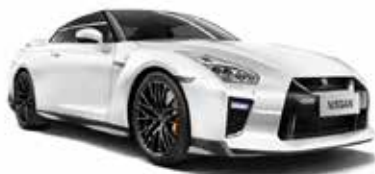
Ivory Pearl (QAB)