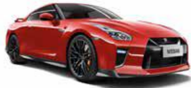
Vibrant Red (A54)