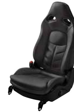
Samurai Black Semi-aniline leather accented #o