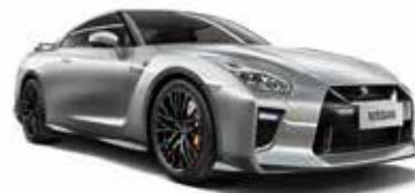
Super Silver (KAB)

Images and colours are indicative only. Colours shown in this brochure may differ from actual colours due to variations in printing processes. Nissan New Zealand reserves the right to change specifications and colours at any time without prior notice. Please check with your local Nissan dealer for the most up-to-date information.