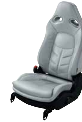
Urban Grey Semi-aniline leather accented #o