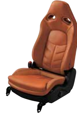
Tan Semi-aniline leather accented #o