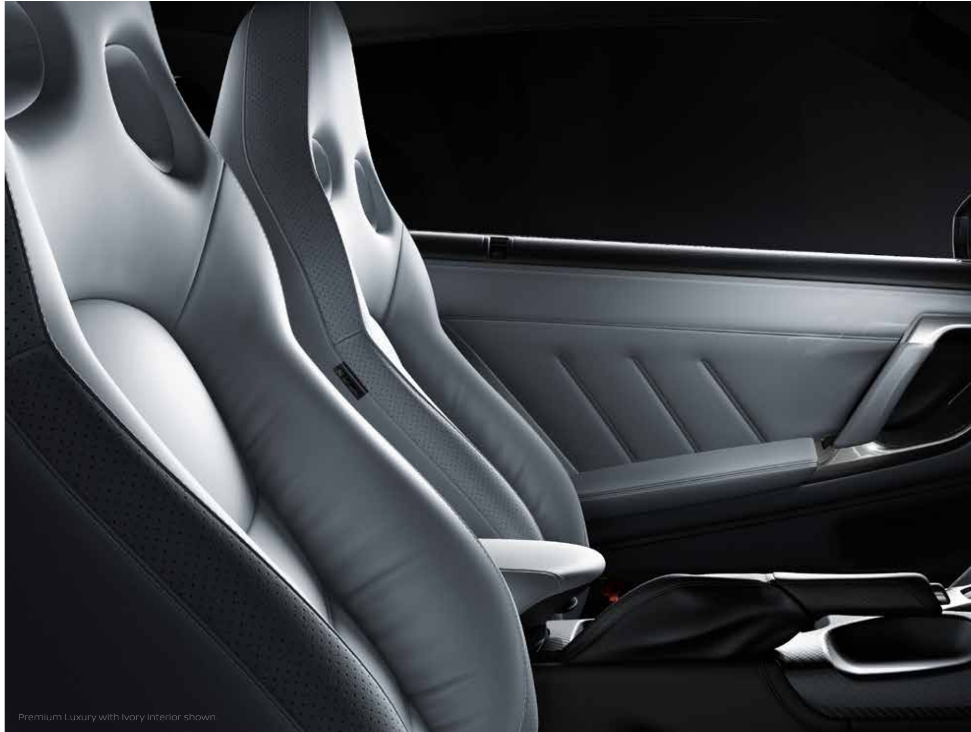
Premium Luxury with Ivory interior shown.