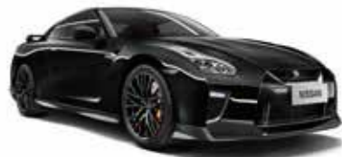
Jet Black (GAG)