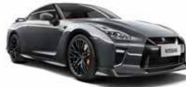
Gun Metallic (KAD)