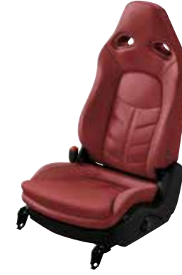
Amber Red Semi-aniline leather accented #o