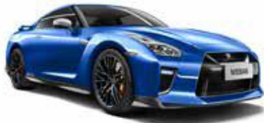
Bayside Blue (RCB)