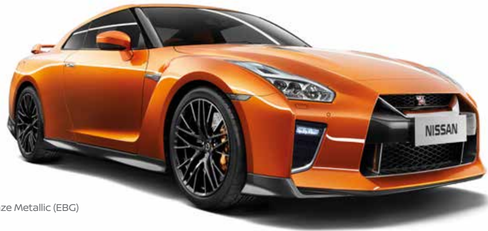
Blaze Metallic (EBG)